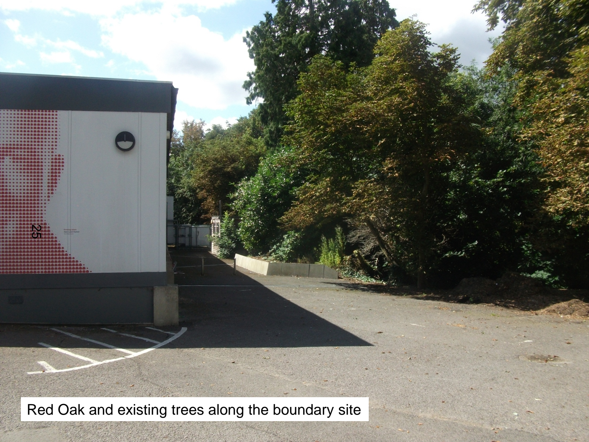
Red Oak and existing trees along the boundary site