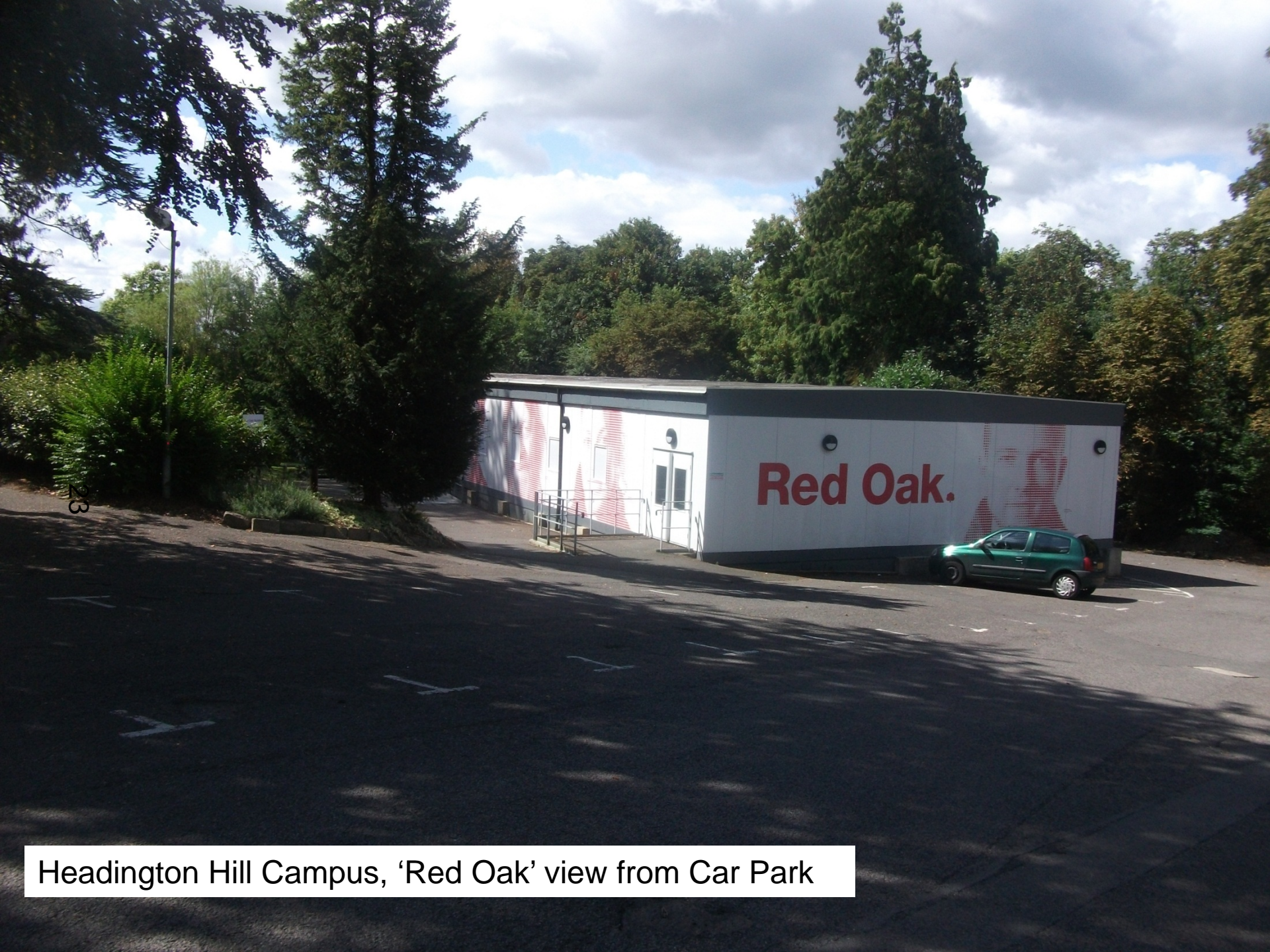
Headington Hill Campus, 'Red Oak' view from Car Park